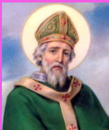
St Patrick's, Stawell