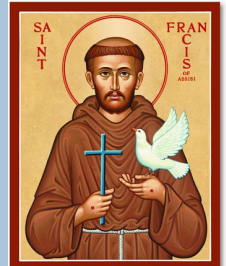
St Francis of Assisi, Landsborough