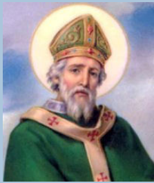
St Patrick's, Stawell