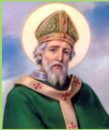
St Patrick's, Stawell