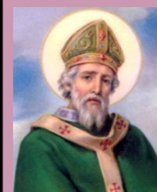
St Patrick's, Stawell

Email: principal@spstawell.catholic.edu.au