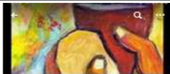
Eucharistic Group PRIVATE GROUP · 21 MEMBERS

For those who have Facebook, and would like to watch Mass at SMJ Church online: