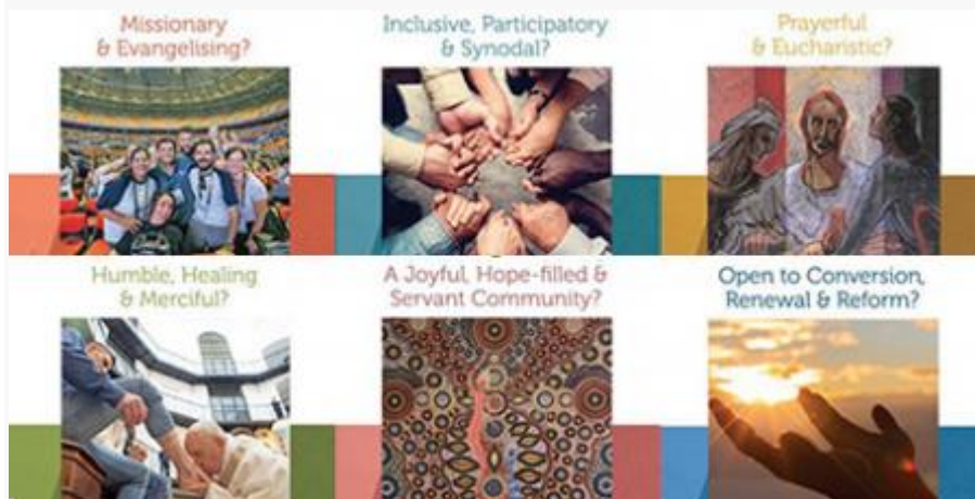
The six Plenary Council themes (ACBC)

Archbishop Timothy Costelloe SDB says the six discernment papers for the Fifth Plenary Council of Australia signify the latest milestone as the Church considers its present circumstances and discerns its future. Six Discernment and Writing Groups, one each for the six national themes for discernment that emerged from the Council's Listening and Dialogue phase, were tasked with writing papers to bring some major themes and issues into focus.