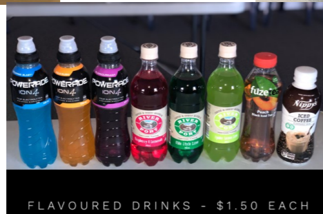
FLAVOURED DRINKS - $1.50 EACH

All drinks are within date and have been donated. A very big thank you to the Stapleton Family. Thank you to all the people who donated jars and ingredients to the café.