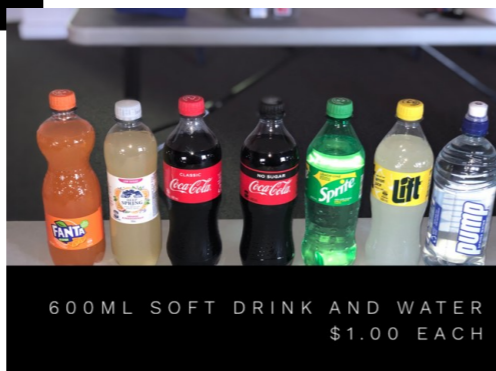
600ML SOFT DRINK AND WATER $1.00 EACH