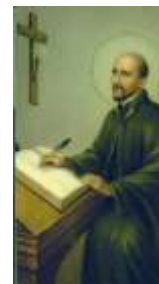
St Ignatius Loyola the Jesuits July 31st