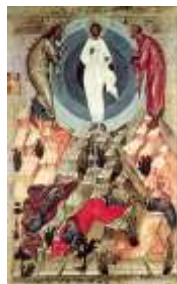
The Transfiguration August 6th