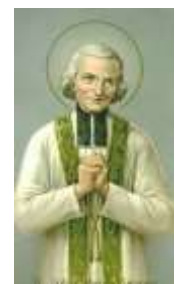
St John Vianney, Patron Saint of Priests