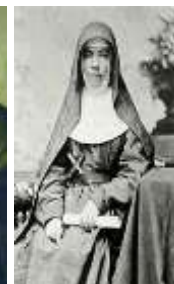
St Mary of the Cross MacKillop the Josephites August 8th

May the quite fire of God's love arise within you. May its flames of joy and peace enlighten your steps in this world. And may you be like the burning bush.