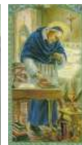
St Dominic, Dominicans August 3rd.