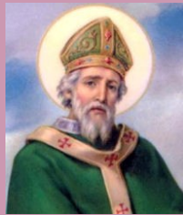
St Patrick's, Stawell