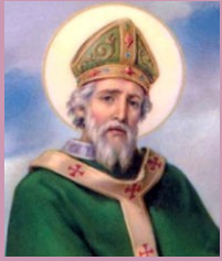
St Patrick's, Stawell