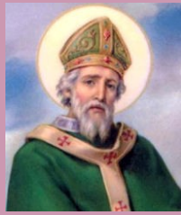
St Patrick's, Stawell