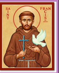
St Francis of Assisi, Landsborough