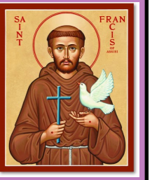
St Francis of Assisi, Landsborough