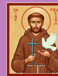
St Francis of Assisi, Landsborough