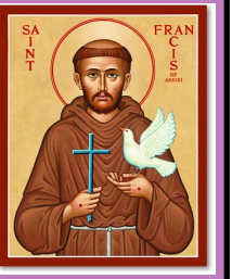
St Francis of Assisi, Landsborough