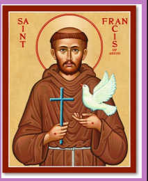
St Francis of Assisi, Landsborough