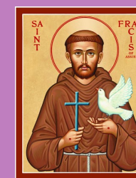
St Francis of Assisi, Landsborough

St Patrick's Parish Newsletter Stawell and Landsborough Sunday 21st February 2021 First Sunday of Lent in Ordinary Time B