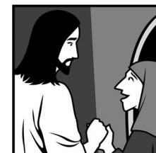
The Gospel of the Lord

In the morning, long before dawn, he got up and left the house, and went off to a lonely place and prayed there. Simon and his companions set out in search of him, and when they found him they said, 'Everybody is looking for you.' He answered, 'Let us go elsewhere, to the neighbouring country towns, so that I can preach there too, because that is why I came.' And he went all through Galilee, preaching in their synagogues and casting out devils.