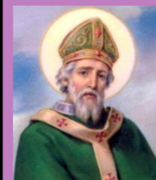
St Patrick's, Stawell

Presbytery Account BSB 013 815 Acc: 286326355