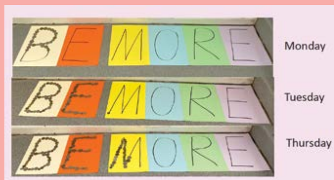
Our 'BE MORE' money line growth pictured early March