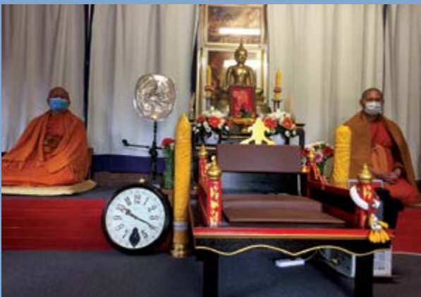
Our Diocesan Community - March 2021