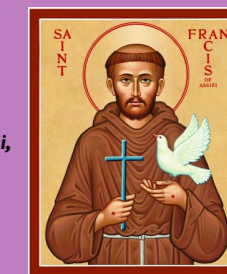
St Francis of Assisi, Landsborough