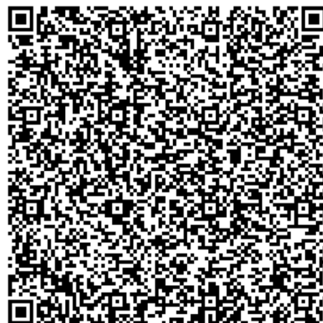
St Columba's Parish QR Code

We appreciate your assistance. In helping stop the spread of the virus.