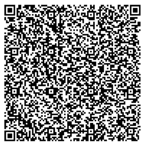
St Columba's Parish QR Code