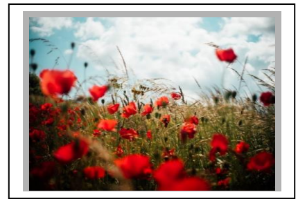
Photo by Oscar Nord. Published on August 30, 2017SONY, ILCE-7 Free to use under the Unsplash License