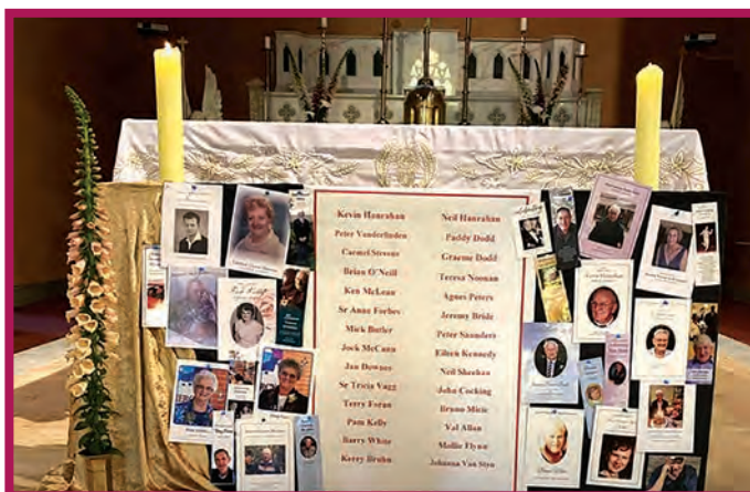
St Alipius Funeral Team

The Remembrance Mass for 2022 was held on Saturday October 29 at 6pm in St Alipius Church. A BBQ was provided for people to stay and have a bite to eat following Mass. The parish hopes that this Remembrance Mass is one way for people to find some peace, knowing that their loved one is in God's care.