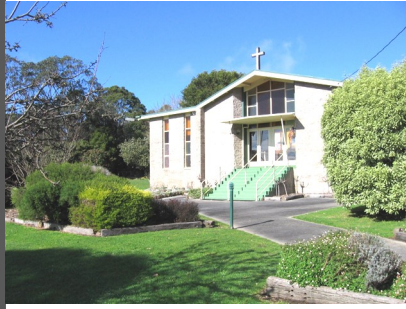
St Joseph's Timboon