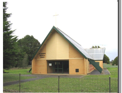
St Andrew's Simpson