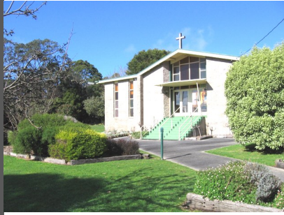
St Joseph's Timboon