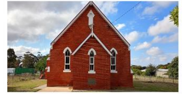
St. John's Church 53, High St, Lismore