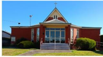
St. Brendan's Church 67, Curdie St, Cobden