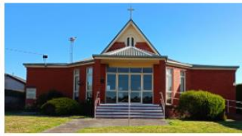
St. Brendan's Church 67, Curdie St, Cobden