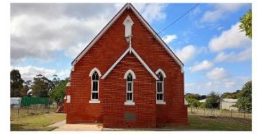
St. John's Church 53, High St, Lismore