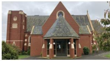
St. Patrick's Church Camperdown

Wall Street Camperdown, PO Box 64, Camperdown VIC 3260 Ph: (03)55931284 Fax: (03) 55932784 Email: camperdown@ballarat.catholic.org.au