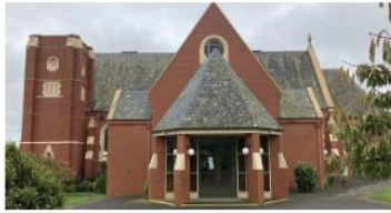
St. Patrick's Church Camperdown

Ph: (03)55931284 Fax: (03) 55932784 Email: camperdown@ballarat.catholic.org.au