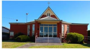
St. Brendan's Church 67, Curdie St, Cobden