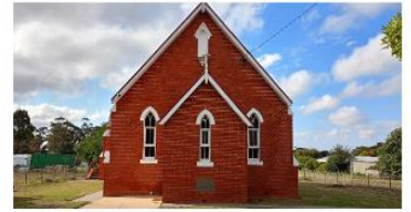
St. John's Church 53, High St, Lismore