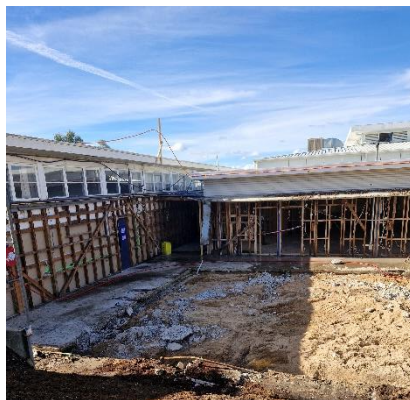
Demolition this week at St. Mary's