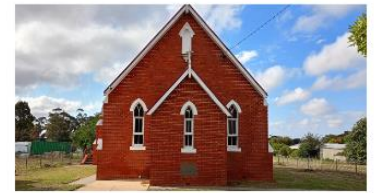
St. John's Church 53, High St, Lismore