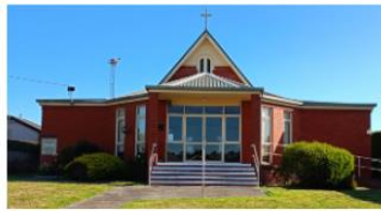
St. Brendan's Church 67, Curdie St, Cobden