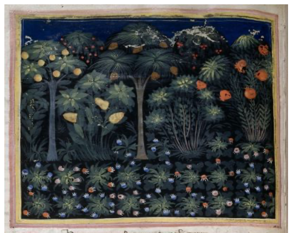
What Fruit do we bear?

They matter because they help to decide our final judgment, and this is where the Second Reading comes in. Paul reminds us that God will destroy death forever, and if we are to share in this victory and live forever with the Lord, then we must take all steps necessary to give our hearts and lips to what is good.